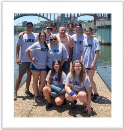
Spencer Baptist Mission Trip 2022 Thank you to our Mission Trip Group who shared God's Love in Knoxville last month

July 5 – 10am – 2pm. Join us at Chuck-E-Cheese! We will have a great time playing games and eating pizza. Cost $10 which includes lunch and games. July 12 – 10am-1pm. Water Fun and More – Wear your bathing suit, bring a towel AND dry clothes. We will enjoy a day of fun at the church with the slip and slides, inflatable baby pools, water balloons, etc. Cost $5 which includes Lunch. July 19 – No Terrific Tuesdays due to Centrikid July 26 – 9am – 4pm. Kool Park – Wear your bathing suit, bring your towel and dry clothes. No wet clothes allowed on the bus. Kool Park is a large swimming pool with a built-in slide and multiple diving boards. There are lifeguards on site, but if your child does not know how to swim, please plan to either come with them, or send them some type of water wings or lifejacket. Cost $12 – bring a picnic lunch.